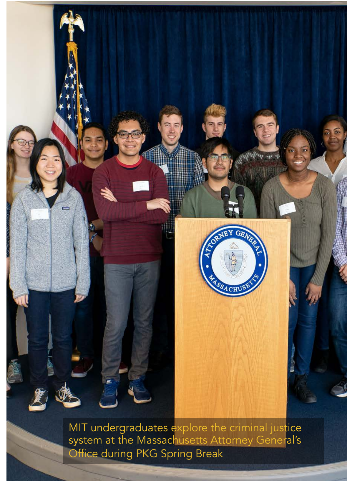
MIT undergraduates explore the criminal justice system at the Massachusetts Attorney General's Office during PKG Spring Break

Your contribution will help students strengthen and apply critical skills through public service experiences such as impactful non-profit internships, self-directed Fellowship projects, and ground-breaking social ventures. Along the way, you'll be helping them build a better world.